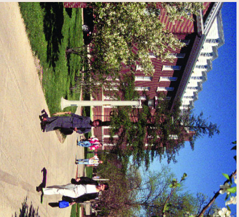
Fell Hall Illinois State University